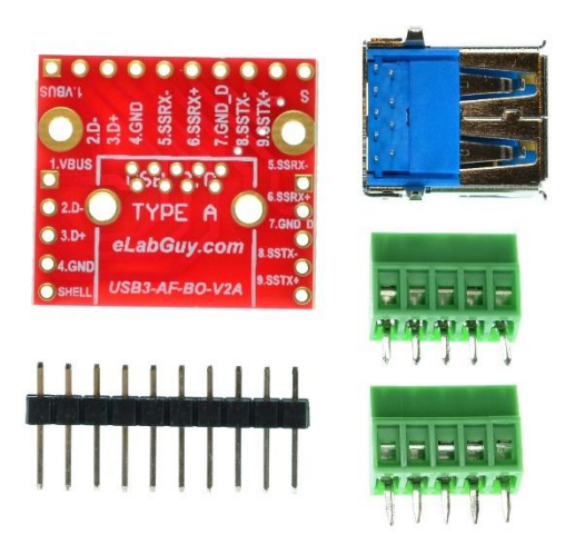
Figure 1: Parts inside the kit (Note: the module is not assembled, user can decide which connector to use on the module.)