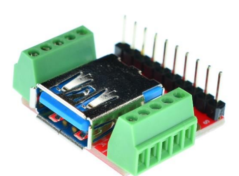
Figure 3:USB3-AF-BO-V2A various connections